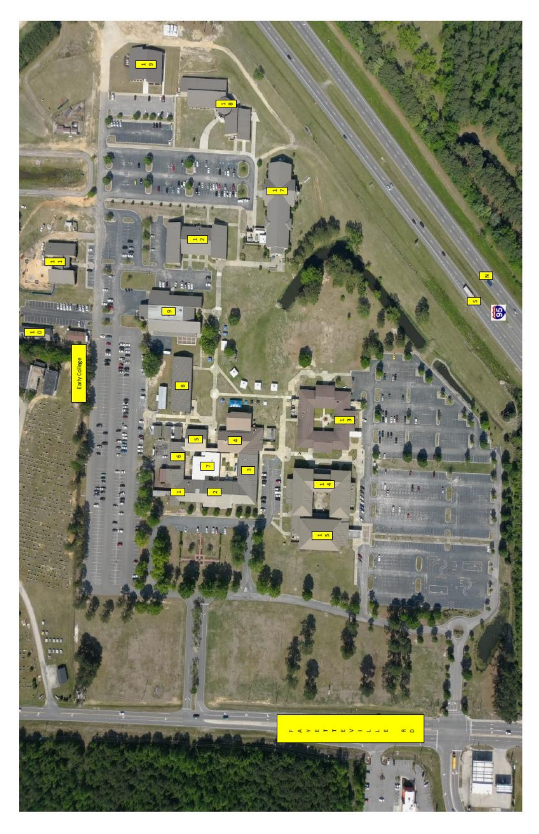
Page 25 of 235 To view an interactive up-to-date version of this catalog with live links, please navigate to <a href="https://catalog.robeson.edu">https://catalog.robeson.edu</a> [opens in a new window]